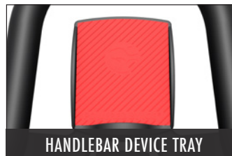
HANDLEBAR DEVICE TRAY