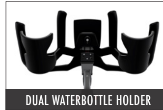
DUAL WATERBOTTLE HOLDER