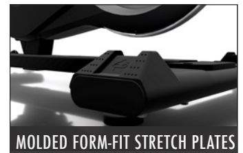
MOLDED FORM-FIT STRETCH PLATES