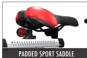
PADED SPORT SADDLE